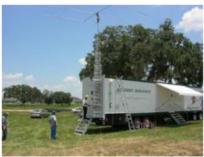
Sumter County Florida Mobile Operations Center was the QTH for the K4VRC Field Day station.

Now mind you this is a given, because after all we ARE communicators aren't we? And with a total of over 1.2 million QSOs reported during FD2007, that's over 50,000 contacts ever hour over a 24-hour period. That's an excellent total – especially when you consider Ol' Sol is being as uncooperative as possible with sunspot. I guess what this really means is that there are always bands which you can utilize, regardless of time of day or propagation.