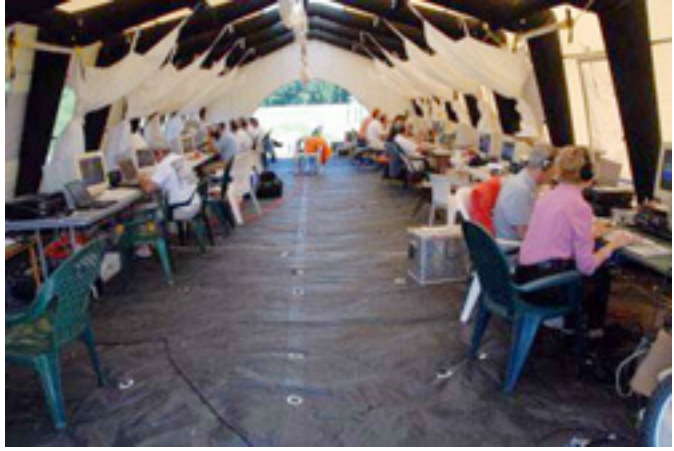
The Hospital Tent held the whole W3AO operating crew with room to spare!