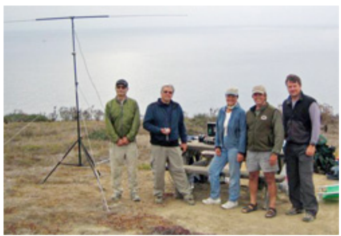
WB6SCP, WA6FGW, KB6LAS, WA9STI, & KI6FKS operating as WA6FGW took up temporary residence on Santa Barbara Island in the Channel Islands National Park, 40 miles off the coast of Malibu, CA.

and repainted an old abandoned WWII communications blockhouse on the beach at Hookipa Maui.