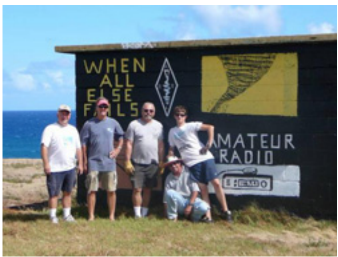
The KH6RS group was definitely "Bitten by the Bug" with Field Day spirit