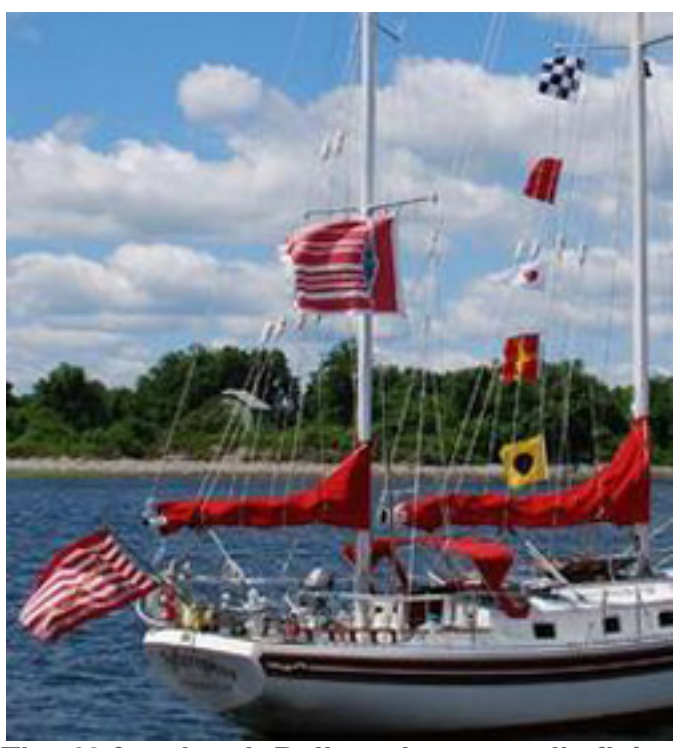
The 46 foot ketch Bellerophon proudly flying the ARRL Battle Flag and the Narragansett Bay Amateur Radio Club Call NB1RI with signal flags.