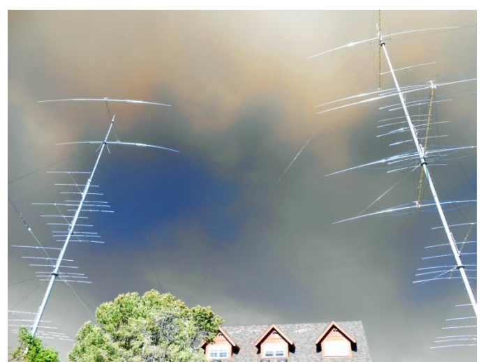
A pair of rotating monopoles holding multiple stacked antennas at W7RN.

Little was said of antennas in the 1930 Sweepstakes report, but it's safe to assume wire antennas were the norm. Most articles of the day referred to coupling to single-wire feed lines and Hertz antennas or doublets and even today, some stations achieve outstanding results in this domestic contest using nothing more than the average city-lot antenna farm.