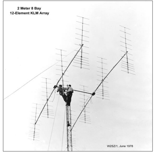
This monster was only put up a few times. It worked well, but was too hard to build on site. It also did not have side lobes low enough for good moon bounce performance.

The photos below were taken in the 1976 to 1980 time frame but are also representative of the WA1MUG setup.