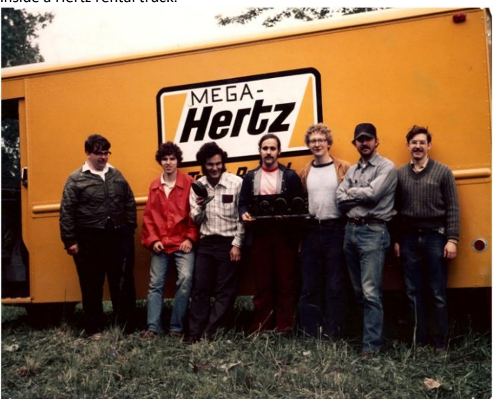
Original Calls: WB2PKO, Unknown, WB2BXP, WA1UGE, WA2AXV, WB2QCJ, WA8USA Modern Calls: WA2AAU W1SZ N2FU

It is not clear what band Dean is operating here, but he was primarily interested in 220 MHz during that time, so that might be a good guess. Note the manual dupe sheets in front of the operator. No computers were used in those days. The operating position here is inside a Hertz rental truck.